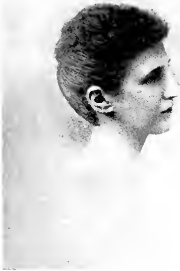
MOLLY ELLIOT SEAWELL.

wrote a story, which was published in "Lippincott's Magazine." She then became a contributor to a number of leading periodicals, using five different pen-names to conceal her identity. In 1888 she began to use her own name. She removed with her family to Washington, D. C., where for a time she wrote political correspondence for the New York dailies. Her first novel, "Hale Weston," was written for "Lippincott's Magazine" in 1887. It was translated into German and had a large sale. Her next book was "The Berkeleys and Their Neighbors," in 1888, and her most successful book, "Throckmorton," appeared in 1889. It has passed through a number of editions. Another of her books is "Little Jarvis." She contributed to the "Youth's Companion" a story that won a prize of five-hundred dollars. Her books are pictures of life in Virginia before the Civil War. She is fond of society, and her home in Washington is a resort of well-known people.